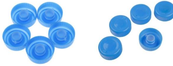
Figure 1: shows two sets of counters