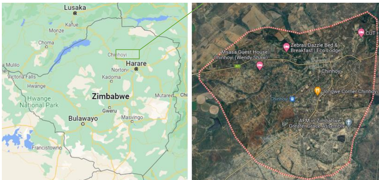
Figure 1: Chinhoyi location (Google Maps, 2023)

The study was conducted in Chinhoyi in the second quarter of 2019. Chinhoyi is the provincial capital of Zimbabwe’s Mashonaland West province. It is located 120 km northwest of Harare, Zimbabwe’s capital.