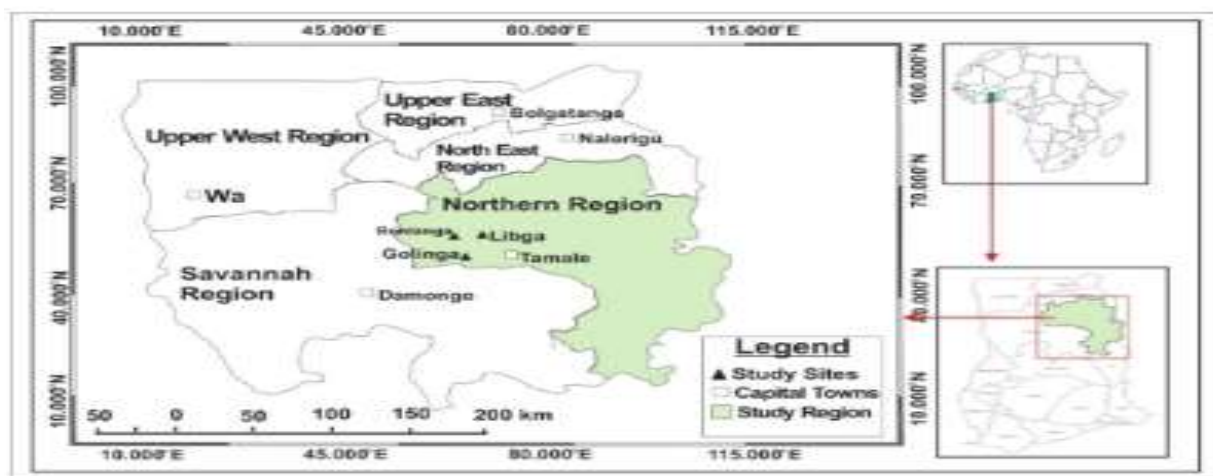
Figure 1: (Salifu et al., 2021) 24

Secondary data was obtained from the internet, books, and published articles. Data were tabulated, graphed, and descriptively analyzed, and the respondents were assured of anonymity. Tamale, the study area, is the regional capital of the Northern Region. The entire region has a population of 2,310,939 people. 22 The population growth rate of the metropolis has been higher than that of the national population growth rate since 2000. 23 Figure 1 shows a Map of the Northern Region of Ghana and the study area, Tamale, where data on the people’s behaviour and beliefs towards COVID-19 and Hepatitis were collected.