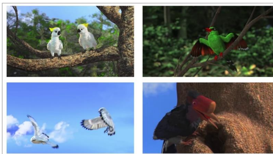
Figure 2. Curved line aspect in visual character illustration style and setting depiction

In this animated music video, four visual characters are shown, namely the Yellow Crested Cockatoo, Bali Starling, Ivory Hornbill, and Ekek Geling. According to Sigit Hermawan, a cinematographer from “Sabda Alam” (researcher interview results), the four characters were made in a realist illustration style to produce a humanist visualization, so that the made-up line elements are dominated by curved lines. As for the background or setting depiction, the formalistic aspect of the line combines horizontal and vertical lines. These two aspects of the line form elongated and widening fields, especially to visualize the natural landscape as a depiction of the habitat of these birds. This combination of horizontal and vertical lines simultaneously forms a visual space where the bird character is placed.