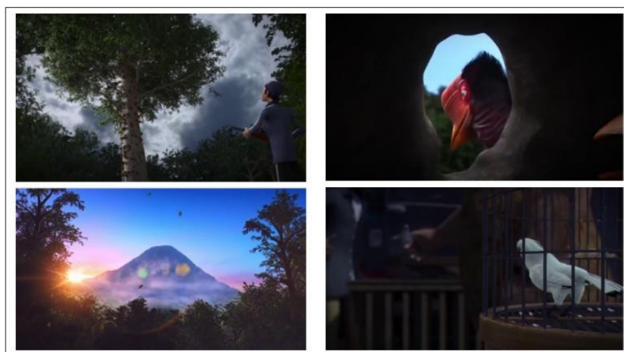
Figure 3. Examples of applying color aspects and using color values to focus on visual objects

In addition, the color display in animated music videos cannot be separated from the lighting aspect, especially to support characterization and background depiction. Four main things must be considered in combining color and light, namely: displaying distant images by presenting contrasting values; the purpose of color value contrast is to bring focus to the image; provide the brightest or darkest light contrast point on the visualization object to focus the view; and gives a contrasting color value to the characters and their backgrounds so that each other can present each other differently. 18 When the character is visualized with lighter and lighter color values, the background is made dimmer or darker, for the visualization of scenes that show a clear sky, the vertical color lighting is designed to be darker, while horizontally it looks lighter.