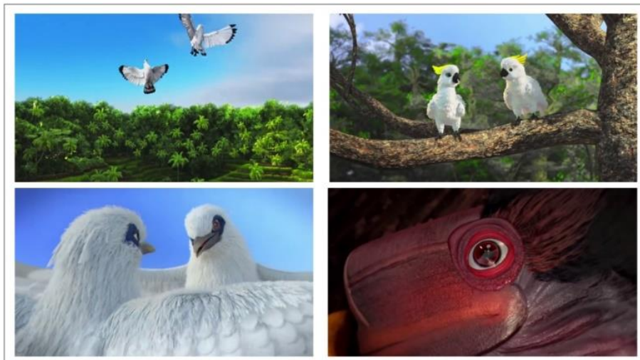
Figure 5. Examples of shot sizes, the wide, medium, medium close-up, and close-up shots

In framing visual space, The Rule of Thirds is used to compose images into thirds of an imaginary grid, both vertically and horizontally. The Rule of Thirds divides the visual space framing group into left framing (objects are on the left), right framing (objects are on the right), middle framing (objects are in the middle), and full framing (objects are on the left, right, and centre).