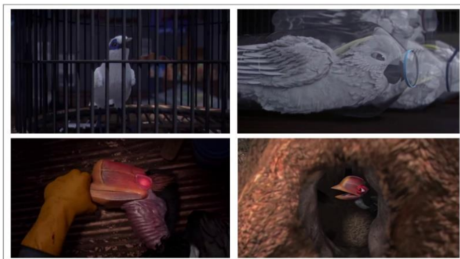
Figure 7. Examples of scenes that stir the emotions of the audience

in cruel endemic birds such as putting them in bottles, in closed boxes, into small drums and cutting off body parts to get their beaks which are worth selling. In addition, at the end of the film, the audience is also aroused by their anxiety through visualization of the habitat area that has dried up and is barren, so that it is no longer suitable as a place to live.