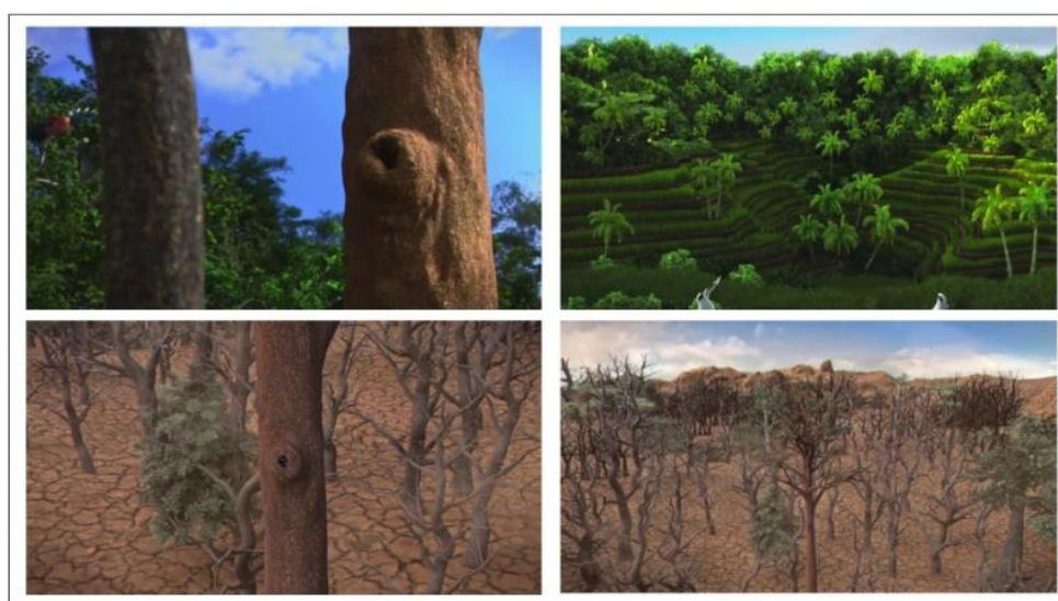
Figure 4. Space and time setting that visualizes the habitat of endemic birds

In this animated music video, the space setting is described as a natural habitat where endemic birds live and breed. On the other hand, the time setting is described as the time span of events in the previous period, namely when endemic birds were still there and the time setting is the contemporary, until finally they are increasingly extinct and the habitat has been damaged.