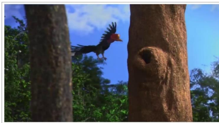
Figure 6. Examples of distance and perspective, the focus of attention, and framing.

The visual space framing also considers two factors in the design principle, proportion and emphasis, namely distance and perspective, as well as focus of attention. In this animated music video, to produce a stronger image proportion that can attract attention, the scene was presented in a medium distance and far perspective, but the foreground was clearly visible. Meanwhile, to determine the focus of attention, a series of scenes in one event tends to use a combination of framing, with a tendency to emphasize the middle framing. This is to emphasize the message that the spectacle object cannot stand alone, but becomes uniformed with the supporting visual elements that surround it.