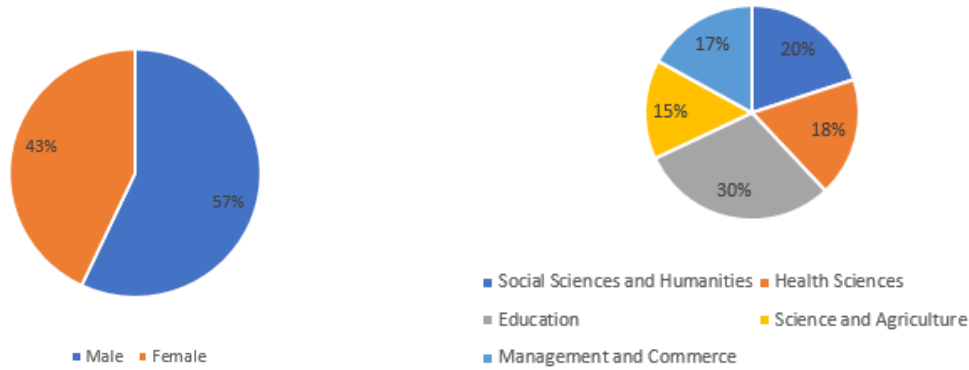
Figure 1: Gender distribution of participants